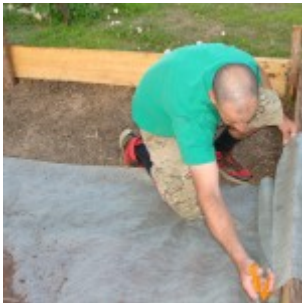
Trimming weed barrier.