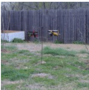
Near the Site location

We used 14-3"x8' Rough Cut Cedar Posts for the Pergola and secured them with structural fastening screws. Davin trimmed the wood with his Stihl 16" Bar chainsaw.