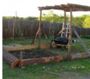
Half the bed is dug, frame is outlines, pergola constructed.