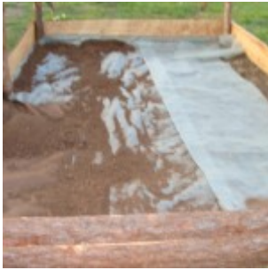
Used a weed barrier 2 feet below the site.