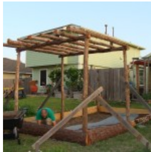
Support Beams used to secure Pergola Garden Bed into place.