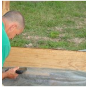
Staple gunned the weed barrier we purchased at Habitat for Humanity, Austin.