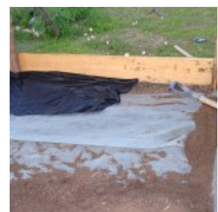
After digging the site we installed the frame.