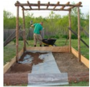
Laying dirt in bed.