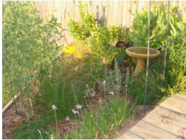
Society Garlic, Rosemary, Hyssop, Oregano, Horehound, Maximillion Sunflower, Melissa, Rose of Sharon, Mexican Sage