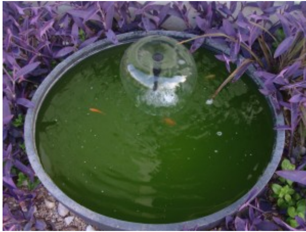
Our fish pond with Tradescantia pallida 'Purple Heart' – Purple Wandering Jew- http://www.designundersky.com/dus/2008/7/2/plants-we-like-tradescantia-pallida-purpurea.html