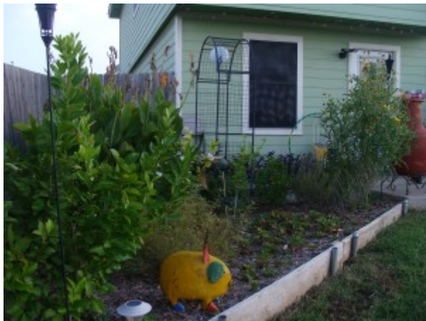
Meyer Lemon Tree, Strawberries, Mexican Oregano