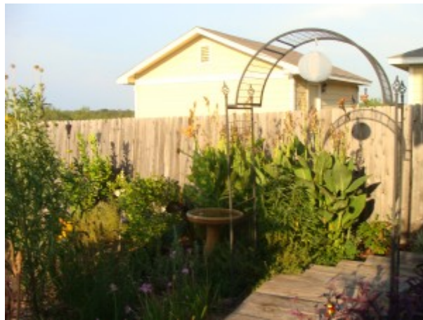
Canas & Citrus Trees along the fence.