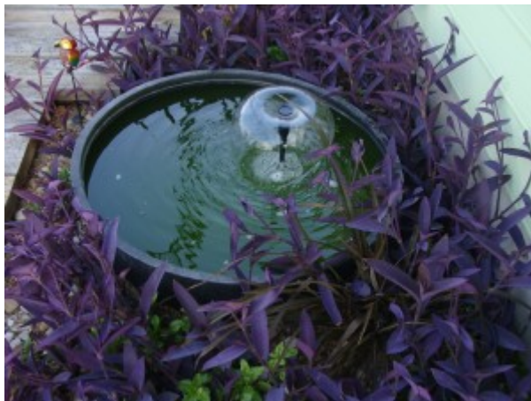
"Purple Heat" Succulent